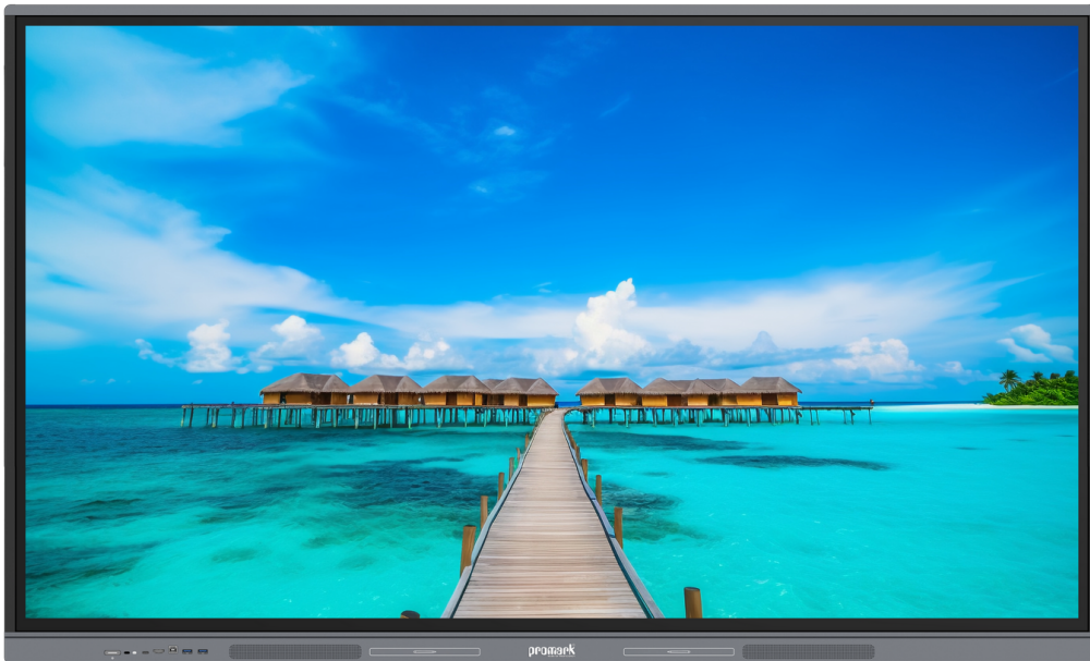
PRODUCT MAY VARY FROM THE ACTUAL PRODUCT